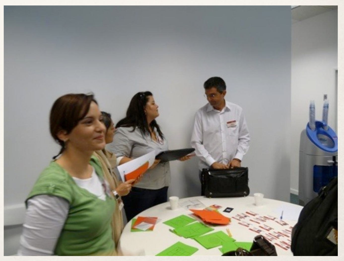
(I wonder what she is thinking?)

Saturday 23rd of October 2010, at about 10:30am